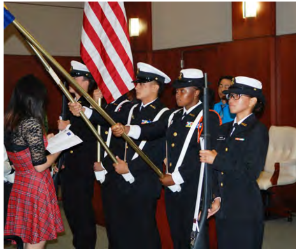
The Guam High School Color Guard presented the colors at the Law Day Naturalization Ceremony on May 2, 2016.

The court also produced two 5-minute videos for the Law Week Celebration: " Miranda Rights: More than Words ", and "Jury Service at the District Court of Guam."