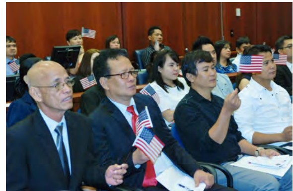
New Citizens at the Martin Luther King Day Naturalization Ceremony on January 20, 2016.