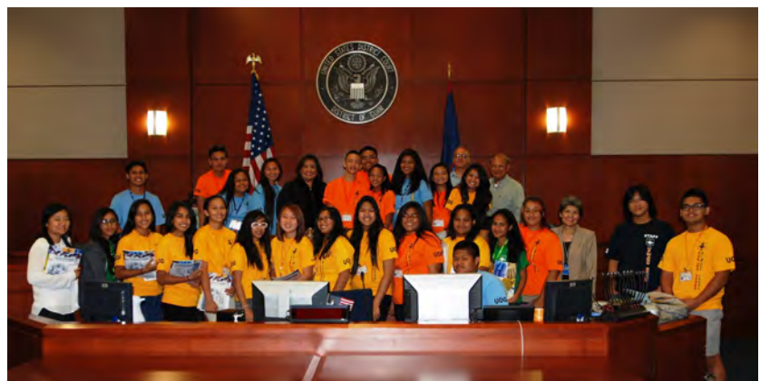
Participants in the Upward Bound program at the University of Guam, all local high school students, toured the District Court on Thursday, July 2, 2015.