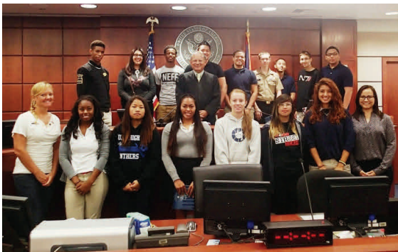
Guam High School Street Law Class, April 29, 2015.