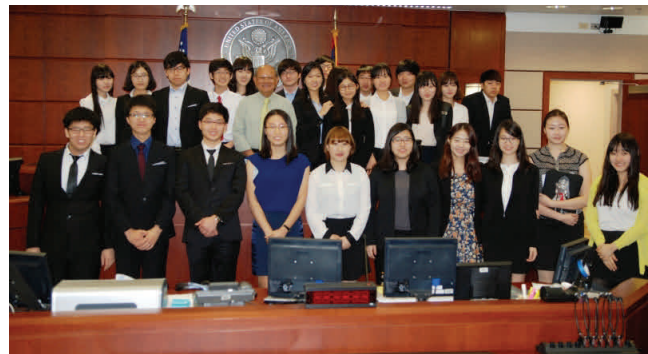
The District Court had the pleasure of hosting four high school Mock Trial teams from Seoul, Korea on Thursday, February 5, 2015.