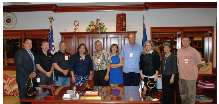
The FBI Citizens Academy held their annual session at the District Court on April 22, 2015 in conjunction with the court's celebration of Law Week 2015.