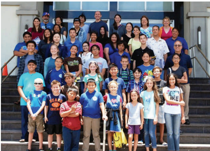
Students and parents from the Guam Home School Association toured the District Court on Monday, May 4, 2015.