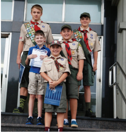
Boy Scouts from Troop 20, Andersen Air Force Base, visited the Court on Wednesday, February 4, 2015.