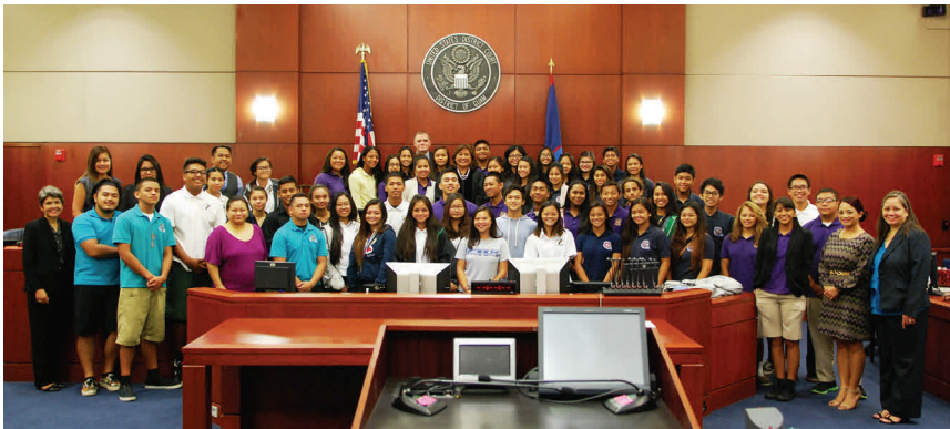
Drug Offender Re-Entry Program, USPO Interactive Panel Discussion with Guam Public High Schools and Launch of Drug Court Video, April 19, 2015.