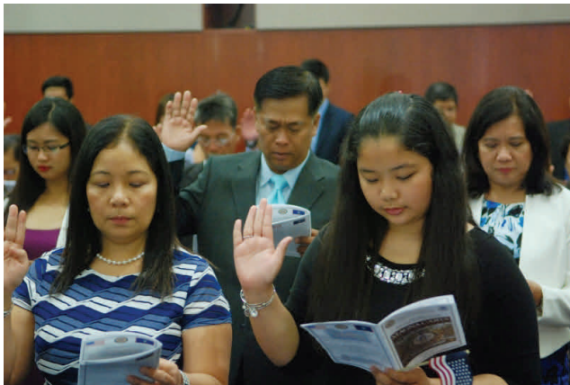
36 people became new citizens of the United States in a special Law Day Naturalization Ceremony held on May 5, 2015.