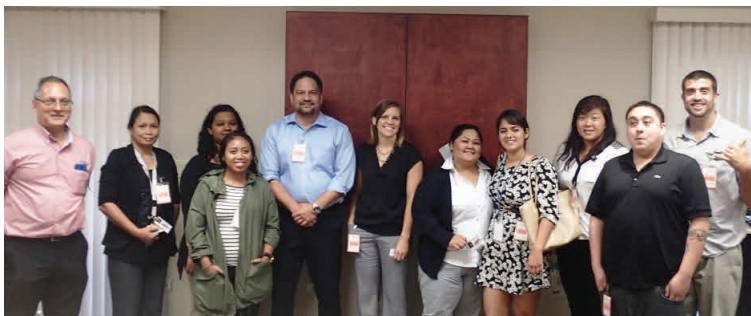
The Court hosted a lunchtime seminar for Guam journalists on Friday, April 24, 2015. The intent of the seminar was to provide island journalists with tools that will facilitate their work and give them an inside look at the business of the District Court.