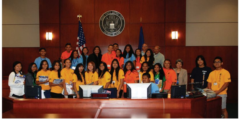
Participants in the Upward Bound program at the University of Guam, all local high school students, toured the District Court on Thursday, July 2, 2015.