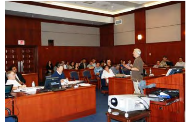
Trial Advocacy Conference Commonwealth of the Northern Mariana Islands joined the training via videoconference.

The District Court, along with the Judiciary of Guam, the Public Defender Service Corporation, and the Guam Bar Association, sponsored a one-day trial advocacy training conference at the District Court for members of the Guam Bar Association. Four senior faculty members from the Tennessee Association of Criminal Defense Attorneys (TACDL) led sessions that included in depth instruction on Voir Dire, Opening Statements, Cross Examination, Closing Arguments, and Ethics in Discovery. In addition to eighty members of the Guam Bar, approximately a dozen members of the Bar Association of the