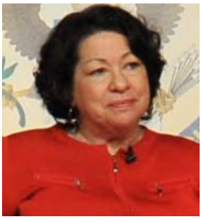
Justice Sonia Sotomayor

The District Court held its Annual District Conference on January 26, 2012, and was honored with the presence of Associate Justice Sonia Sotomayor of the Supreme Court of the United States. Justice Sotomayor, joined by Chief